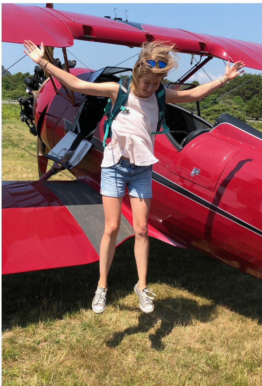
Fig 2 | Representative study participant jumping from aircraft with an empty backpack. This individual did not incur death or major injury upon impact with the ground

The PARACHUTE trial satirically highlights some of the limitations of randomized controlled trials. Nevertheless, we believe that such trials remain the gold standard for the evaluation of most new treatments. The PARACHUTE trial does suggest, however, that their accurate interpretation requires more than a cursory reading of the abstract. Rather, interpretation requires a complete and critical appraisal of the study. In addition, our study highlights that studies evaluating devices that are already entrenched in clinical practice face the particularly difficult task of ensuring that