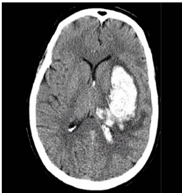
Fig 2 Computed tomography of an intracranial haematoma