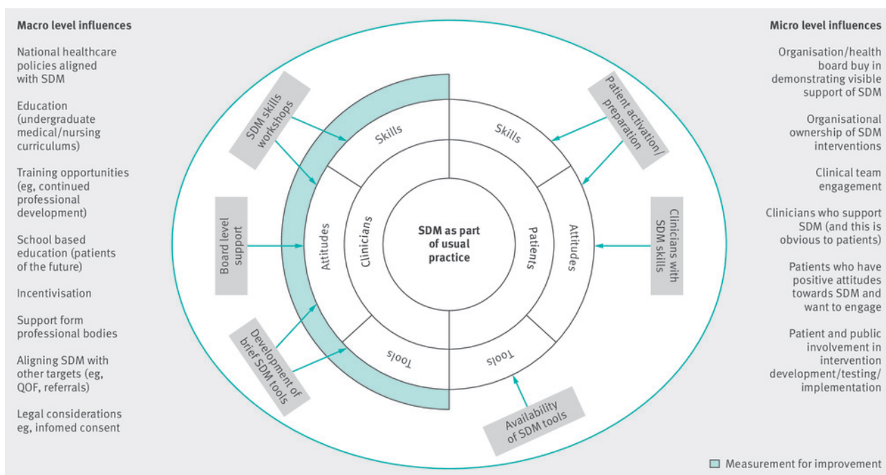
Fig 2 Summary of key factors influencing implementation of shared decision making (SDM). (QOF=Quality and Outcomes Framework)

BMJ: first published as 10.1136/bmj.j1744 on 18 April 2017. Downloaded from http://www.bmj.com/ on 19 April 2024 by guest. Protected by copyright.