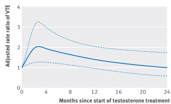
Fig 2 | Adjusted rate ratio of venous thromboembolism (VTE) and 95% confidence limits by time on current testosterone treatment. Testosterone treatment includes first time and repeat testosterone use

To mitigate the effect of polycythaemia as a potential mediator as well as of prostate cancer, a contraindication for testosterone use that could have altered the testosterone exposure status, we did sensitivity analysis without additional adjustment for polycythaemia and excluding all cases and controls with a history of prostate cancer. The study results remained basically unchanged. Nevertheless, unmeasured confounding remains a limitation. Another limitation is the potential