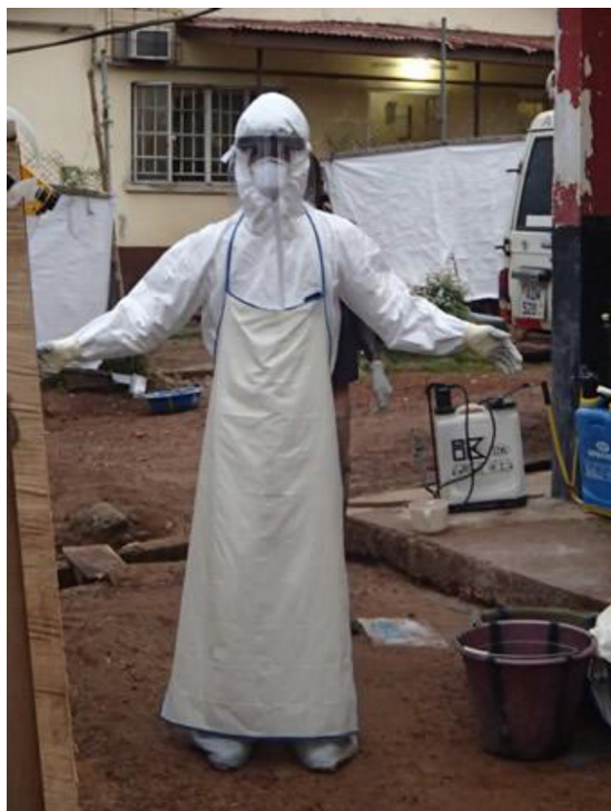
Fig 3 Healthcare worker in personal protective equipment at an Ebola treatment centre in Sierra Leone, 2014