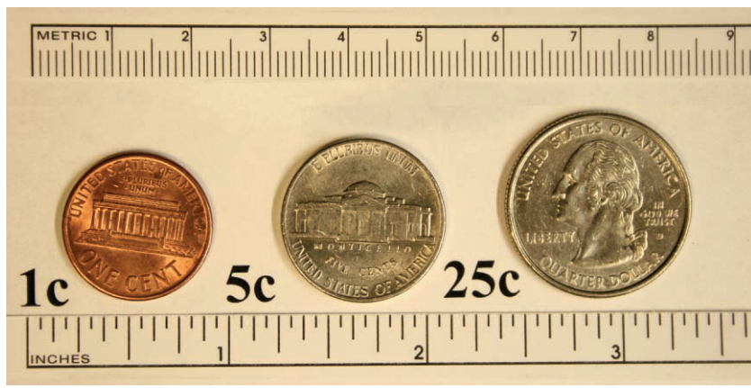
Fig 2 | Coin denominations extracted