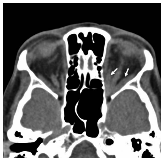
Fig 1 | Computed tomography/magnetic resonance imaging of the orbits showing typical features of thyroid eye disease. Medial and inferior recti are enlarged (arrows). Even patients with clinically unilateral disease are usually found to have bilateral enlargement of muscles on imaging

Thyroid eye disease is an autoimmune disorder, with associated thyroid autoimmunity always discernible. 4 The presence of one or more shared autoantigens between the thyroid and the orbit may explain why retro-orbital tissues are affected. 5,6 Extraocular muscles and retro-ocular connective tissue are infiltrated by lymphocytes, leading to activation of cytokine networks and inflammation and interstitial oedema of the extraocular muscles. 7,8 Excess secretion of glycosaminoglycans by orbital fibroblasts seems to be an important contributor. The end result is expansion of the volume of extraocular muscles, retro-orbital fat, and connective tissue. Similar changes affect the eyelids and anterior periorbital tissues. Smoking