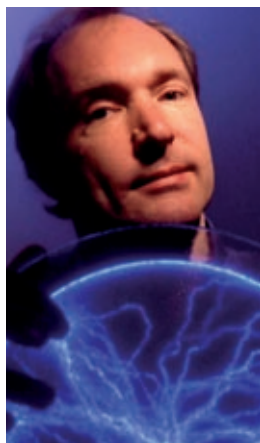
TIM BERNERS-LEE