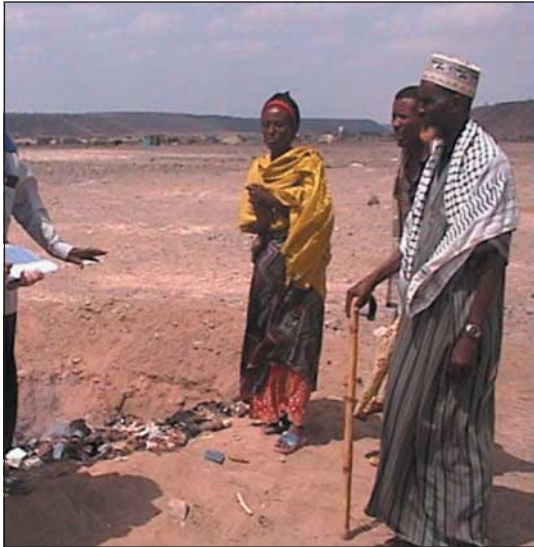
Rubbish disposal initiative in Djibouti

The programmes strongly emphasise community involvement and intersectoral collaboration, facilitated by WHO linkages with ministries of health (see bmj.com ). Intersectoral coordination encourages government departments to work together, mobilises communities, and involves them in the development process. Intervention sites are identified in response to a request from the local residents. Each village is divided into clusters of 25 to 40 households. Each cluster elects one representative. The cluster representatives then nominate a village development committee. An intersectoral technical team provides training and back-up support and helps conduct a baseline survey. Each household is asked to identify their top three social development priorities. The final interventions are decided by the community on a consensus basis.