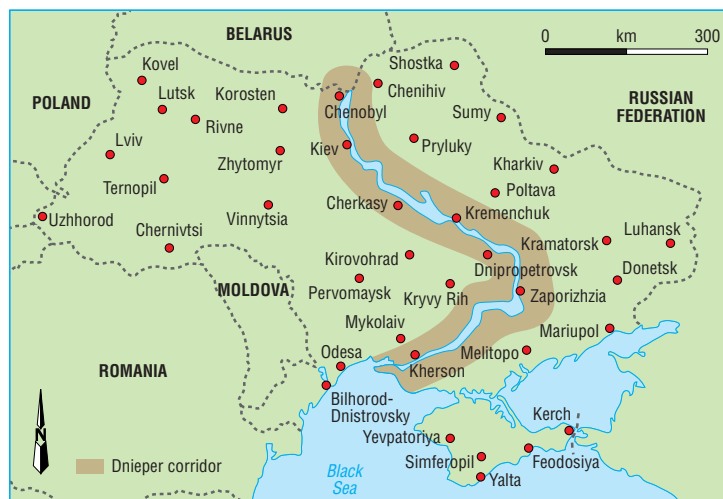
Fig 2 Ukraine's River Dnieper corridor has a high coincidence of drug use and HIV rates

Just over half the population is in the 15-49 age group (the core workforce), with young adults (ages 15-29) in the highest HIV risk group. (The actual population figures are contested but evidence of progressive reduction in population numbers is widely accepted.) Epidemiological data are collected inside Ukraine without systematic cohort analysis. This has made it