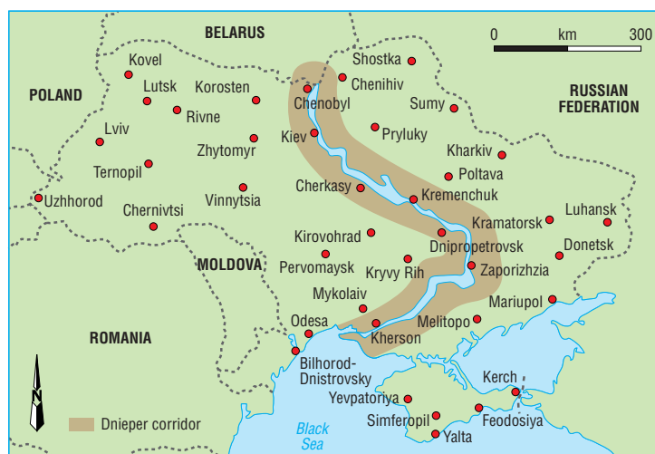
Fig 2 Ukraine's River Dnieper corridor has a high coincidence of drug use and HIV rates

Just over half the population is in the 15-49 age group (the core workforce), with young adults (ages 15-29) in the highest HIV risk group. (The actual population figures are contested but evidence of progressive reduction in population numbers is widely accepted.) Epidemiological data are collected inside Ukraine without systematic cohort analysis. This has made it