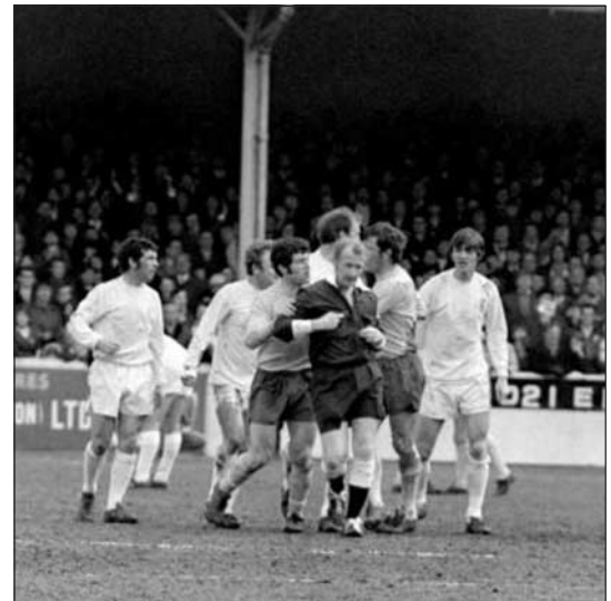
Ruling offside has long been one of the most controversial decisions a referee has to make

Convergence occurs when the gaze shifts from a far to a near object or when it tries to focus on an approaching object. 1 Divergence is the opposite—transferring the gaze from an intermediate distance to a far or receding object, and more usually gazing into infinity (daydreaming). Latency is 160 ms.