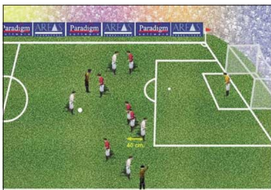
Fig 2 Top: No offside, players in correct position. Bottom: 100 ms later (players' velocity 7.14 m/s), offside