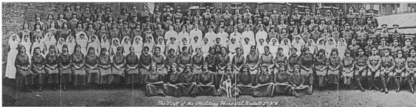
"The staff of the military hospital, Endell Street." From Flora Murray's "Women as Army Surgeons"

many essential duties of Army Medical officers which cannot be performed by Medical Women."