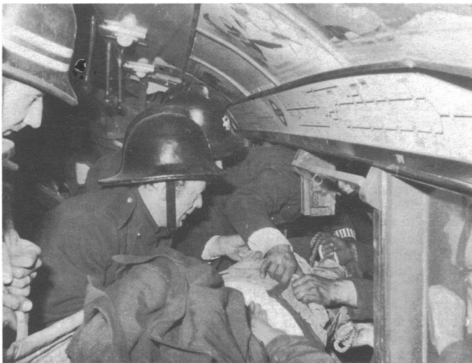
FIG. 2—Casualty being removed from train by firemen.