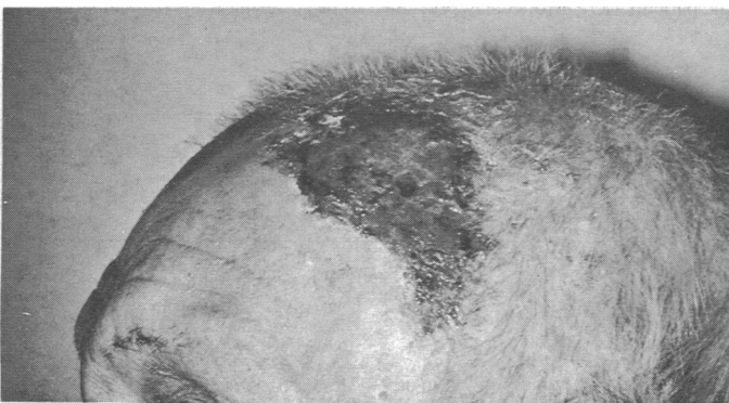
Two weeks after the accident; new hair growth has started.