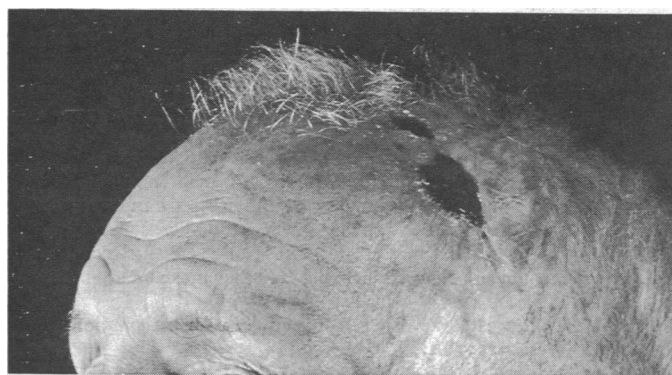
Six weeks after the accident; hair is now thicker.