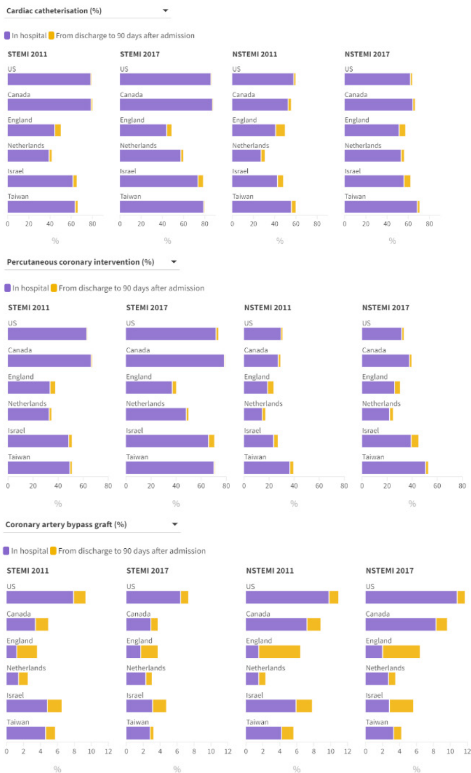
Fig 1 | Proportion of patients receiving cardiac catheterisation, percutaneous coronary intervention, and coronary artery bypass graft surgery in hospital and within 90 days of index hospital admission. Colour coding indicates proportion of 90 day care received during index admission. Rates standardised to age and sex distribution of US acute myocardial infarction population in 2017. 2013 data shown for the Netherlands; 2011-12 data unavailable. NSTEMI=non-ST elevation myocardial infarction; STEMI=ST elevation myocardial infarction. An interactive version of this graphic is available at https://bit.ly/3vBjtMh

low use in these countries. 15 36 37 The differences between countries are probably a manifestation of those that have prioritised the development,