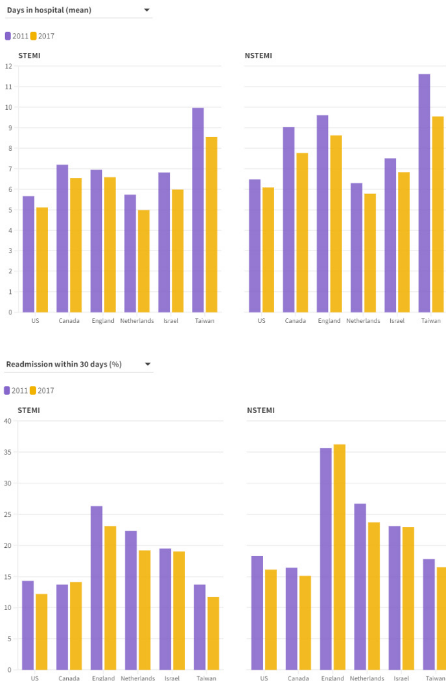
Fig 3 | Measures of health system efficiency. Hospital length of stay and 30 day readmission rate for STEMI and NSTEMI by country. Rates standardised to age and sex distribution of US acute myocardial infarction population in 2017. 2013 data shown for the Netherlands; 2011-12 data unavailable. NSTEMI=non-ST elevation myocardial infarction; STEMI=ST elevation myocardial infarction. An interactive version of this graphic is available at https://bit.ly/3OGAFJd

standpoint, the US was able to achieve a relatively low 30 day readmission rate while simultaneously maintaining a lower hospital length of stay than other countries. Taken together, these findings suggest that hospital throughput in the US is relatively efficient. Alternatively, England, with long hospital length of stay and high readmission rates, would seem to have opportunities for improved efficiency. In evaluating efficiency, it is important to mention our decision not to