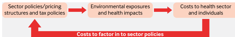
Fig 2 | Cost transfer from various sector policies to the health sector and individuals

Acting on environmental risks can reduce health inequity, as women and the poor are disproportionately affected. Women and children are more exposed to harmful smoke caused by cooking, heating, and lighting with unclean fuels and inefficient technologies. Environmental risks to health can to some extent be influenced through personal choices (vegan diet, transport choice) but are likely to be more affected by policy measures (incentivising clean technologies, carbon and fuel taxation) necessary to deliver on the Paris Agreement on climate change. Implementing wide