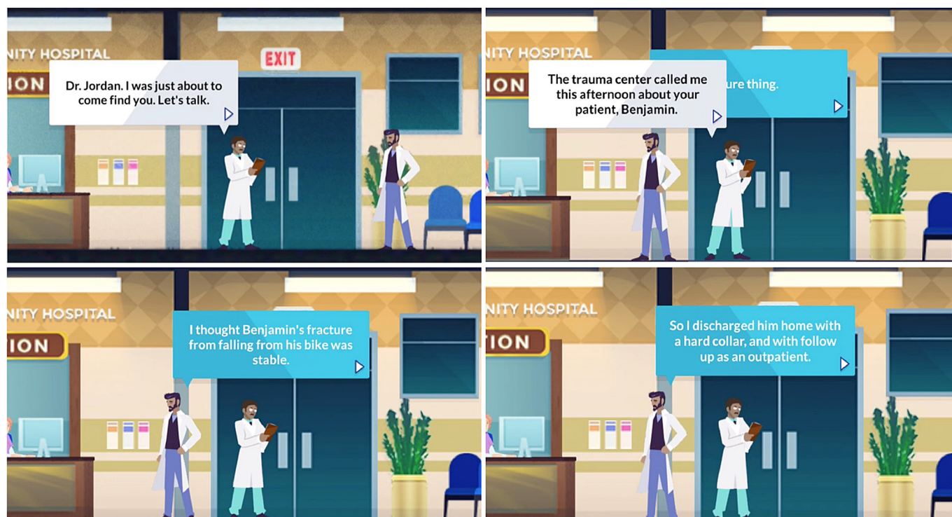
Fig 1 | Selected screenshots from interaction between Andy and his boss, the department chair. In this instance, Andy has failed to transfer a patient (Benjamin) with a cervical spine fracture to a trauma center, and Benjamin has returned with a central cord syndrome. During the conversation, players can choose how they want to respond to the department chair's criticism of their performance, either accepting responsibility or arguing that the complication represents the natural evolution of the disease process rather than a diagnostic error

The ideal standard educational strategy in trauma is Advanced Trauma Life Support (ATLS)—a two day seminar designed to teach participants to resuscitate and stabilize trauma patients and to determine if