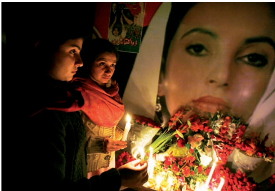
Mourners light candles in front of a portrait of Benazir Bhutto in Lahore

Legal and medical experts say that the only way to establish the cause of her death would be to exhume and examine her body, something her family has opposed so far.