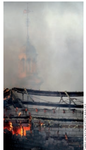
The fire at the Royal Marsden hospital

"This has been a difficult time for our patients and our staff and I would like to give special thanks to them for the patience and hard work they have all put