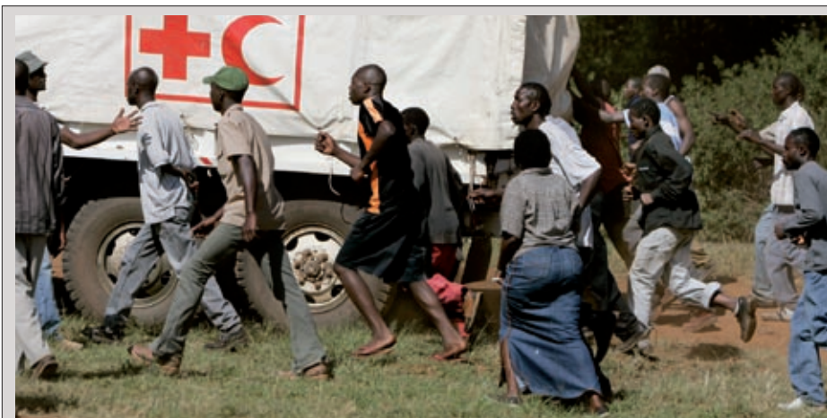
Residents of a Nairobi slum follow a Red Cross vehicle