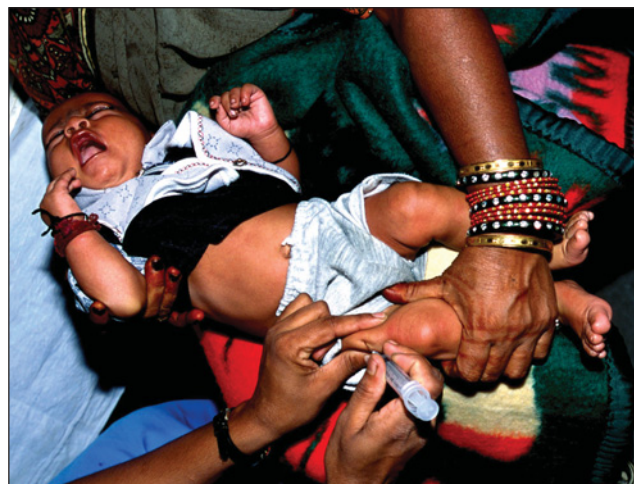
The Indian Medical Association says vaccinating babies against hepatitis B is wasteful as carrier status is often transmitted vertically