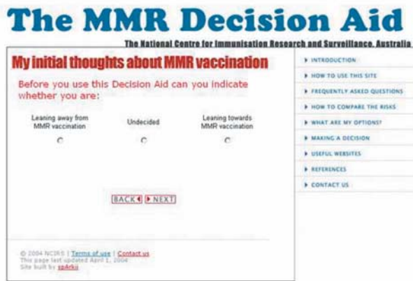
Fig 1 Screen from MMR vaccination decision aid: direction of leaning about vaccination

sion Aids. 9, 13 The aid provided numerical and graphical evidence of the risks associated with the diseases, alongside the potential risks associated with the vaccine, and provided references for these estimates. We used Australian data where possible, supplemented with evidence from large international epidemiological studies, systematic reviews, and meta-analyses.