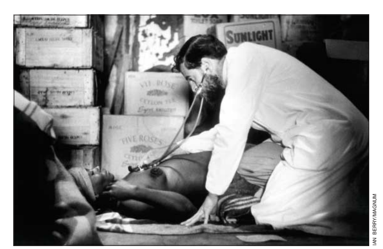
In 1961, missionary doctors were using warehouses for their clinics

epidemiologists scrambling to formulate health indicators to measure the effectiveness of health systems.