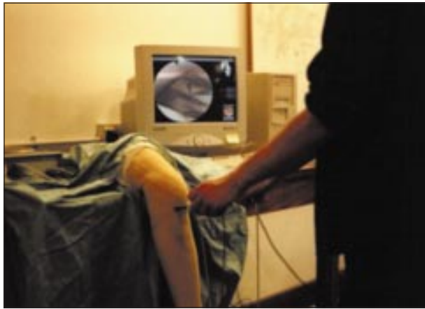
Model of a knee with simulated display used for training

attitudes, may be better transferred by role models away from the centres of academe.