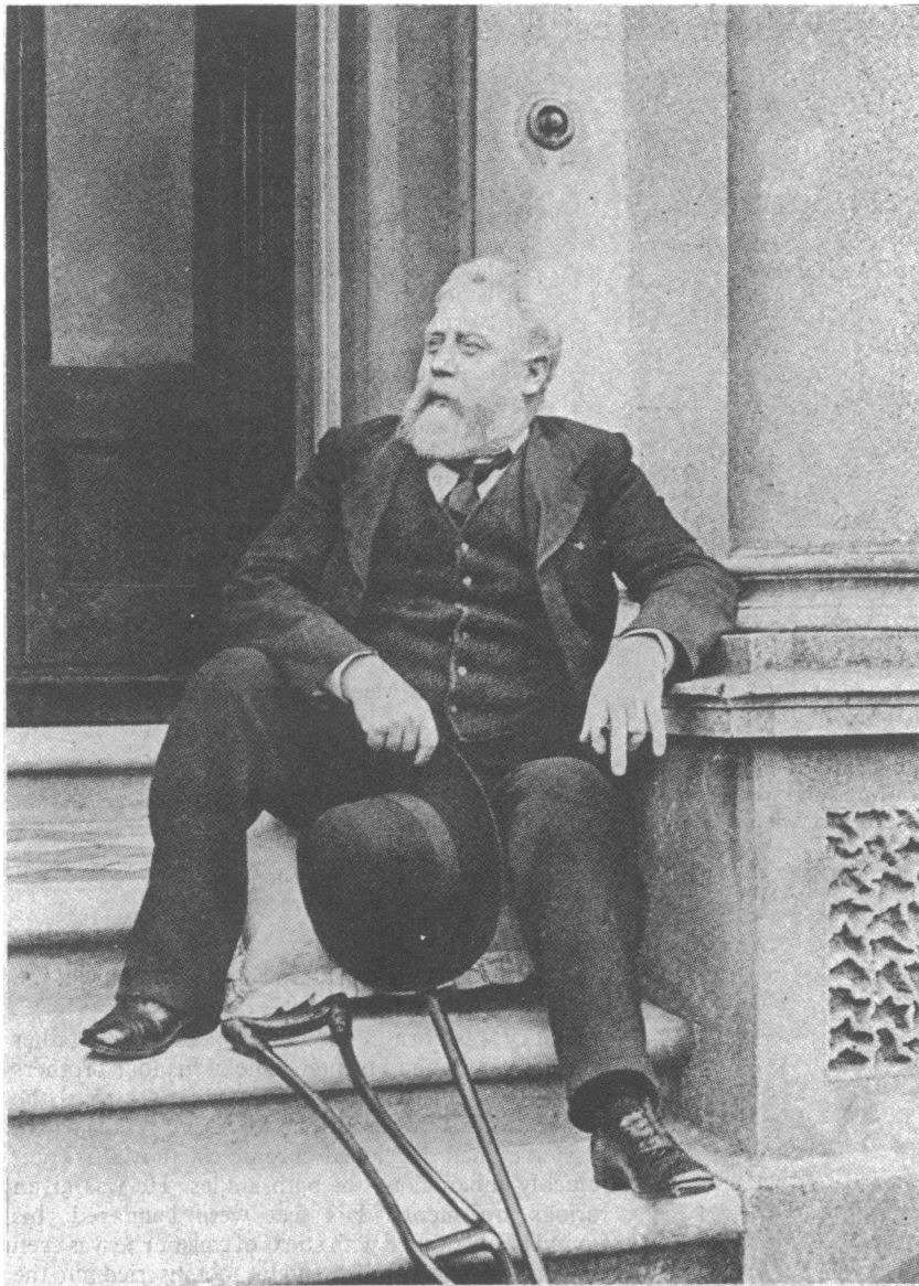
W E Henley, 1899

affection. He learns to take an interest in the politics of the tiny republic of which he is for the moment a citizen. He discovers acquaintances everywhere and among them there are sure to be some with whom he can be sociable and friendly. The air is murmurous with gossip: a hundred petty incidents, in which the patient has an interest, are daily taking place beneath his eyes: and in a milieu that is a very hotbed of scandal, it is odds but he becomes a scandalmonger himself.