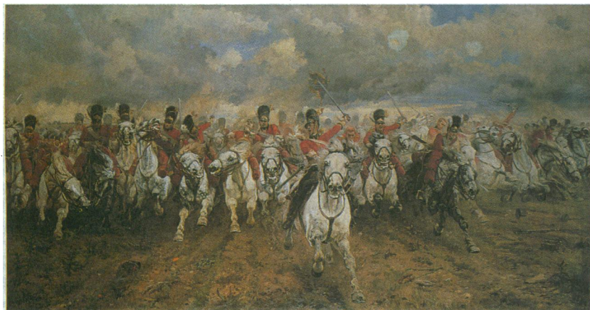
"Scotland for Ever." Lady Butler's dramatic portrayal of the charge of the Scots Greys.

Correspondence to: Whitegates Cottage, 23 Gastons Road, Malmesbury, Wiltshire SN16 0BE