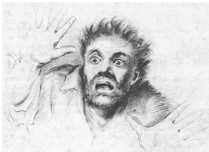
Fear mingled with wonder (p 142). This drawing is believed to be the work of David Wilkie.