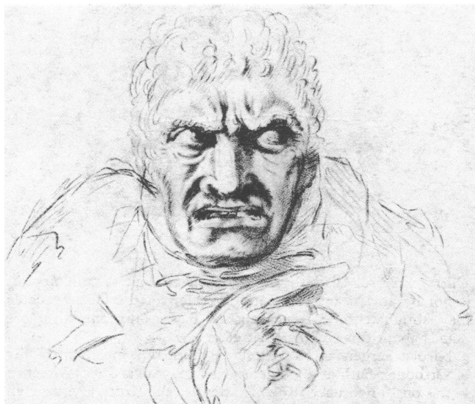
Suspicion or jealousy (p 136).

December 1804 and wrote that he had "the greatest conceit of himself I ever knew a man to possess." 4