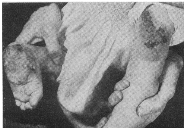
FIG. 1.—Vaccinial lesions 18 weeks after vaccination.