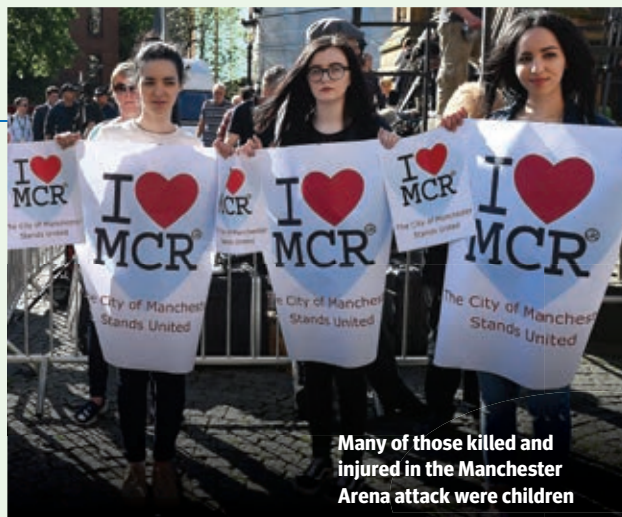
Many of those killed and injured in the Manchester Arena attack were children

The night after the London Bridge attack, King's had eight major