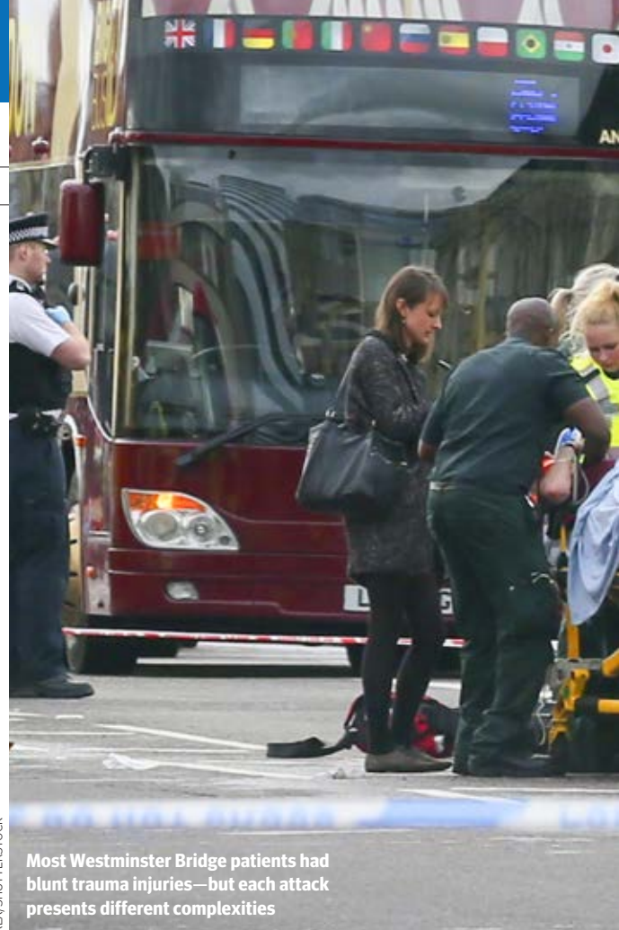
Most Westminster Bridge patients had blunt trauma injuries—but each attack presents different complexities