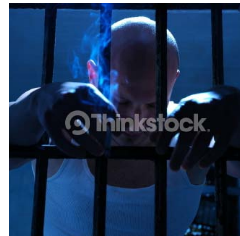
Tough on criminals' health, p 19

Articles appearing in this print journal have already been published on bmj.com, and the version in print may have been shortened. bmj.com also contains material that is supplementary to articles: this will be indicated in the text (references are given as w1, w2, etc) and be labelled as extra on bmj.com.