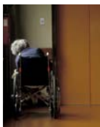
Joined up care, p 27