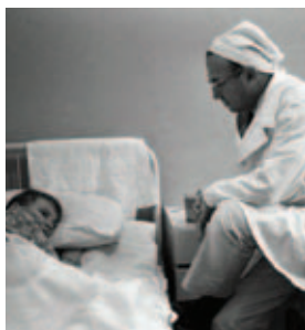
Soviet TB doctor dies, p 28