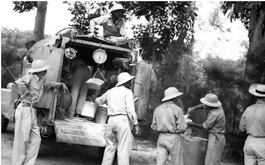
SWISS TROPICAL INSTITUTE