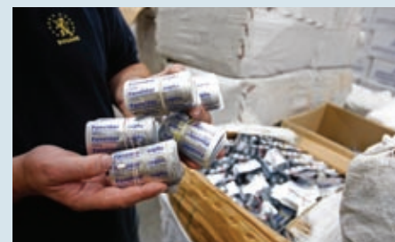
European Union agencies seized 2.5 million counterfeit medicinal products in 2007