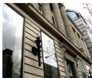
Academics fear that closure of the centre could undermine the Wellcome Trust Library