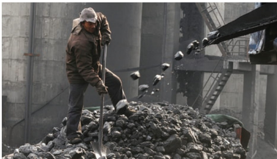
At least a million Chinese workers are thought to have pneumoconiosis; few can afford to seek compensation