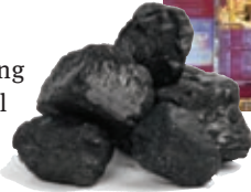
The Wellcome supermarket is refusing to restrict sales despite the research

The study, conducted with the cooperation of Hong Kong's two major supermarket chains, Wellcome and ParknShop, showed that in one district the rate of suicides (number per 100 000 population) by charcoal burning halved during the 12 months when barbecue charcoal was available