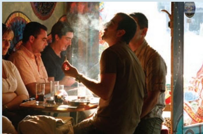
There was a "significant increase" in smoking in all cafes in 2009