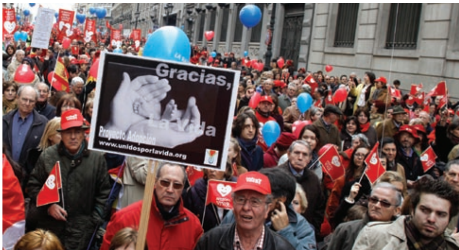
Marchers against the change this week were fewer than those who marched in favour of reform last year

However, the law faces strong opposition from Catholic and pro-life groups and from the conservative Popular Party, the main political party in the opposition. Leaders of the Popular Party announced that they would repeal the