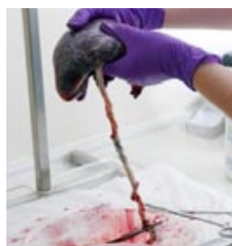
In one case, cord blood was collected in a car park

allow time to ensure that a person with the required training and who is operating under an authority licence is available to collect the