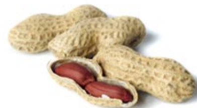
Peanut allergy, p 593