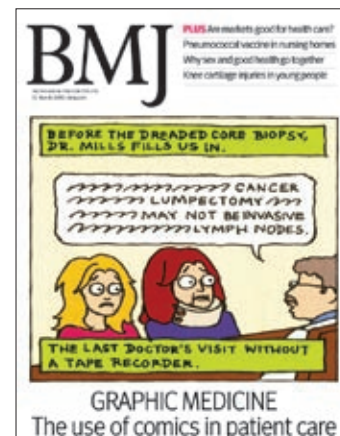
Analysis , p 574, Review , p 600

Cover image from Cancer Vixen by Marisa Acoella Marchetto