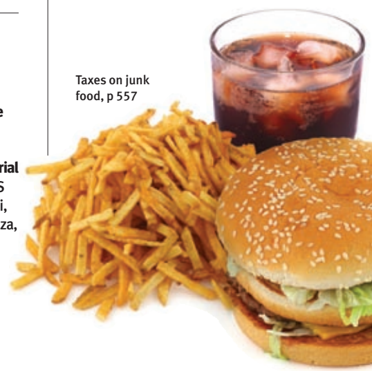
Taxes on junk food, p 557