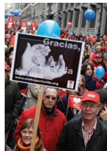
Anti-abortion campaigners in Spain, p 559