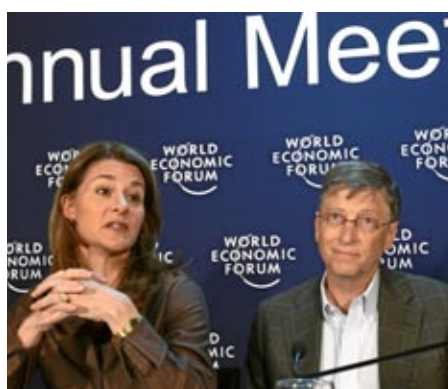
Polio is on the verge of being eradicated thanks to Bill and Melinda Gates's commitment to GAVI

Since GAVI was created, more than 250 million children have been immunised and five million deaths have been prevented. New data from the World Health Organization show that from 2000 to 2009 the percentage of children receiving three shots of the diphtheria, tetanus, and pertussis vaccine in the poorest countries of the world jumped