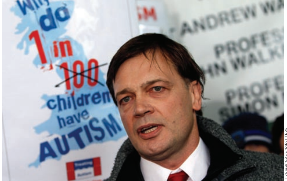
Dr Andrew Wakefield was found guilty of dishonesty, and research on developmentally disordered children without ethical approval and contrary to their clinical interests

One of the biggest public health scares in UK history was triggered by Dr Wakefield’s study of 12 children, published in the Lancet in 1998 (351:637-41). Although the paper conceded that it had not found a definite link between the vaccine and autism, Dr Wakefield, then a consultant gastroenterologist, caused a furore when he suggested during a press conference at the Royal Free Hospital in north London, where he worked at the time, that single vaccines for measles, mumps, and rubella might be preferable to a triple vaccine.