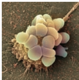
Ovarian cancer cell

Despite symptoms being common, the predictive value of the symptoms for ovarian cancer was