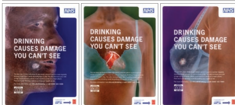
The rising number of deaths highlights “our destructive relationship with alcohol,” said Ian Gilmore