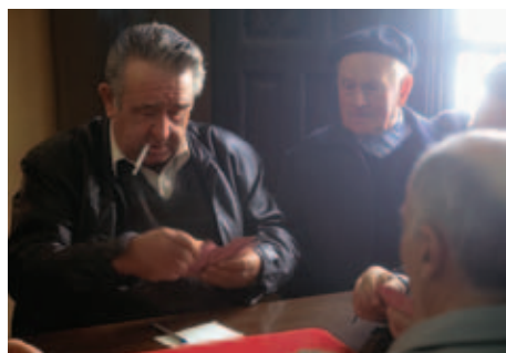
The tobacco industry saw Spain as an “important testing ground for the protection of markets”

The draft law, which could take effect in January, seeks to ban smoking in enclosed public places. A law passed in 2006 had the same purpose, but that legislation was so emasculated during its passage through parliament that 90%