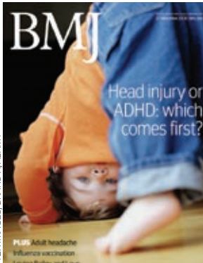
Editorial, p 1179 Research, p 1208

Articles appearing in this print journal have already been published on bmj.com, and the version in print may have been shortened.