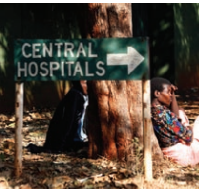
Zimbabwe's health system, p 1239