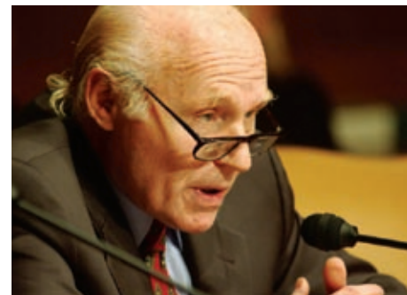
US senators Chuck Grassley (left) and Herb Kohl (right) are investigating links between doctors and industry