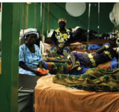
Fighting the brain drain, p 958