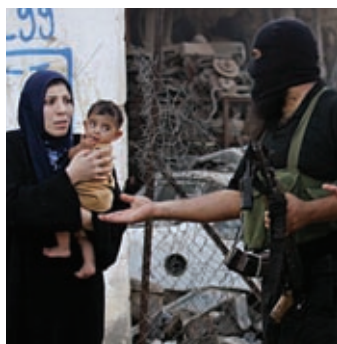
Mental health conference blocked, p 950