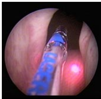
Minimally invasive treatments for benign prostatic enlargement, p 966