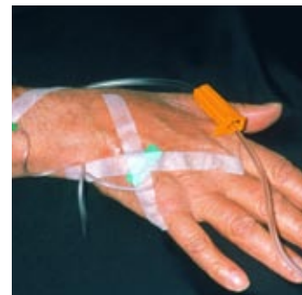
Guidelines: Prescribing intravenous immunoglobulin, p 990