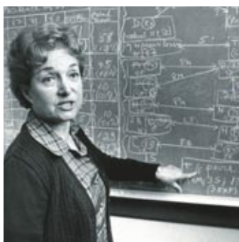
Obituary: AIDS pioneer Selma Dritz, p 957