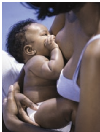
Advice on vitamin D, p 953