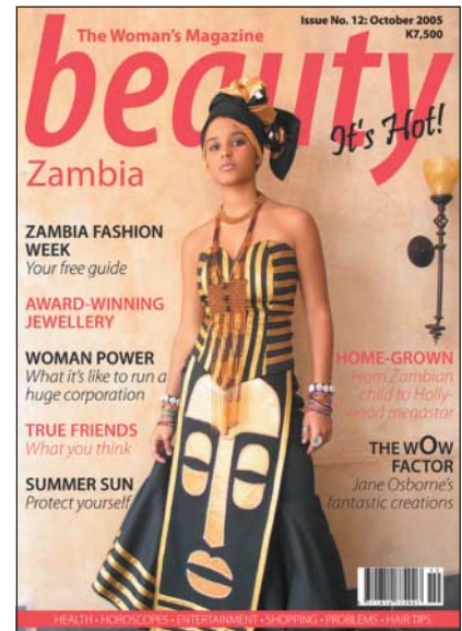
Showing a glamorous and hopeful side to life

HIV/AIDS is a prime example. According to 2003 estimates, 16% of adults in Zambia are HIV positive. Prevalence rates vary between urban and rural areas. Donors have pumped tens of millions of pounds into the country to try to tackle the