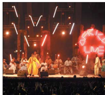
Celebrating Africa: Youssou N’Dour and the Grand Orchestre du Caire

Africa Live is also available on DVD to help educate Westerners who are unaware of Africa’s malaria epidemic. Malaria was eradicated from southern Europe and the United States in the 1960s. It has reappeared with a vengeance in Africa thanks to the conflicts and disasters of the 1980s and 1990s, when control efforts and healthcare systems collapsed.