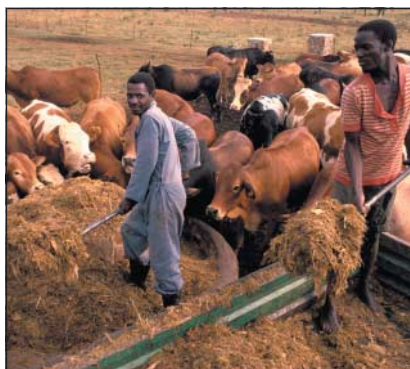
Most farmers are forced to sell at a loss