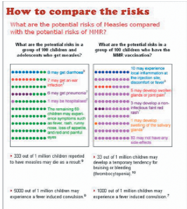
Fig 2 Screen from MMR vaccination decision aid: comparison of risks

Respondents’ attitudes were coded as -1 for “leaning away from,” 0 for “undecided,” and 1 for “leaning towards” vaccination. We