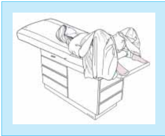
Fig 2 Positioning of women with draping for examination without stirrups (drawn by Jordan Mastrodonato)

relation to satisfaction or compliance with cervical smears. Afterwards, women completed a questionnaire regarding the examination. We used 100 mm visual analogue scales to measure physical discomfort, sense of vulnerability, and sense of loss of control. Study identification numbers were used to preserve anonymity of the respondents. We had previously piloted the questionnaire on 25 women. We assessed the quality of smears according to adequacy and the presence or absence of endocervical cells reported in the pathology reports.