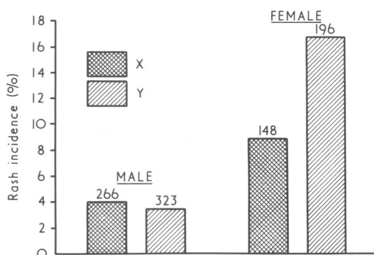
FIG. 1—Incidence of rash in patients after treatment with X or Y material (see text).

Of the 933 patients entering the trial, 68 developed a rash—an overall incidence of 7.3%. The incidence of rashes in males was 22/589 (3.7%) whereas in females it was 46/344 (13.4%). This difference is statistically significant ( P < 0.01 ). The incidence of rashes with X material was 44/519 (5.8%), while with Y material it was 24/414 (8.5%). This difference is not statistically significant. In males the incidence of rashes with X and Y material was similar, but in females there was a significantly lower incidence after treatment with X material (fig. 1). The age and sex distribution of rashes is shown in table I.