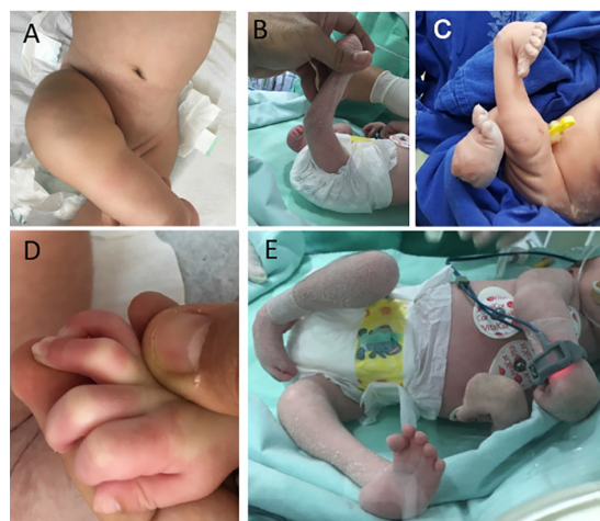
Fig 1 | (A) Contracture in flexion of knee; (B) hyperextension of knee (knee dislocation); (C) clubfeet; (D) deformities in 2nd, 3rd, and 4th fingers; (E) joint contractures in legs and arms, without involvement of trunk

Nerve conduction studies and needle electromyography was performed in all seven children. Nerves studied were median and ulnar (sensory and motor conduction studies), tibial and fibular (motor conduction studies), and medial plantar (sensory conduction