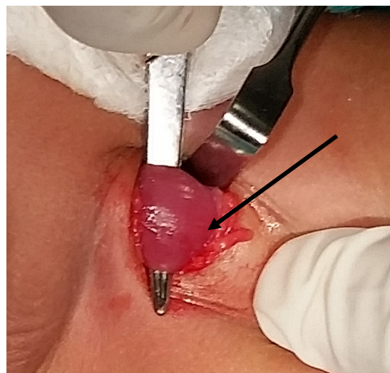
Fig 4 | Adductor longus muscle of child with irreducible dislocation of hips before surgery. Colour is characteristic of fibrofatty infiltration, typical of initial phase of neuropathies

the body. Arthrogryposis is not a specific diagnosis, but rather a clinical finding, and it is a characteristic of more than 300 disorders. 19 Arthrogryposis can be divided into subgroups, as a way of generating a differential diagnosis, which includes neurological diseases (brain, spine, or peripheral nerve), connective tissue defects (diastrophic dysplasia), muscle abnormalities (muscular dystrophies or mitochondrial abnormalities), space limitations within the uterus (oligohydramnios, fibroids, uterine malformations, or multiple pregnancy), intrauterine or fetal vascular compromise (impaired normal development of nerves, or