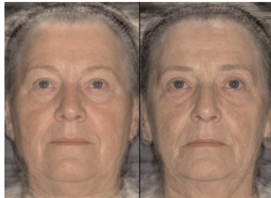
Fig 1 | Composite pictures each representing average appearance of groups of 10 twins aged 70 (range 69-71). Left hand image represents twins who looked younger for their age (average perceived age 64, range 57-69) than those represented by right hand image (average perceived age 74, range 70-78)

The assessment of physical functioning was based on an adaptation of an instrument developed and previously