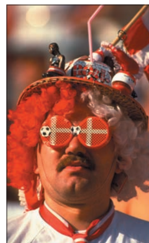
Dane, at peace