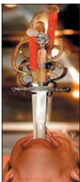
Fig 1 One of the authors (DM) swallowing seven swords

Once the swallower has got the sword past the cricopharyngeal sphincter and relaxed the oesophagus, he or she must learn to control retching so the sword can be passed down to the cardia. The cardia lies about 40 cm from the teeth and the sword straightens the flexible and distensible oesophagus. Further progress depends not only on the swallower learning to relax the lower oesophageal sphincter and controlling retching but also on the shape of the stomach. The angle of the gastro-oesophageal junction and lesser curve vary, being obtuse in the vertically oriented stomach, particularly when it is full, and more acute in the high horizontal stomach often present in thickset