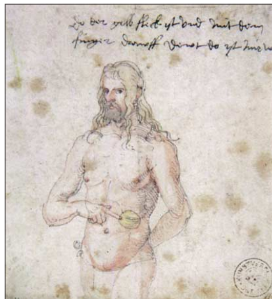
The Sick Dürer , by Albrecht Dürer (1471-1528), held at the Kunsthalle, Bremen.

Though the illness remains unclear, and though the picture cannot be exactly dated, Dürer was