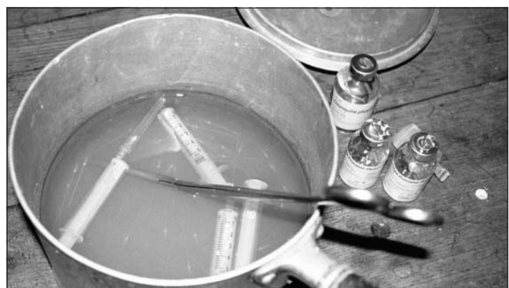
Fig 1 Injection equipment soaked in tepid water before reuse in the absence of sterilisation, Africa, 2000. Note the plastic syringes rinsed in the tepid water and the multidose medication vials

Additional references w1-w21 appear on bmj.com