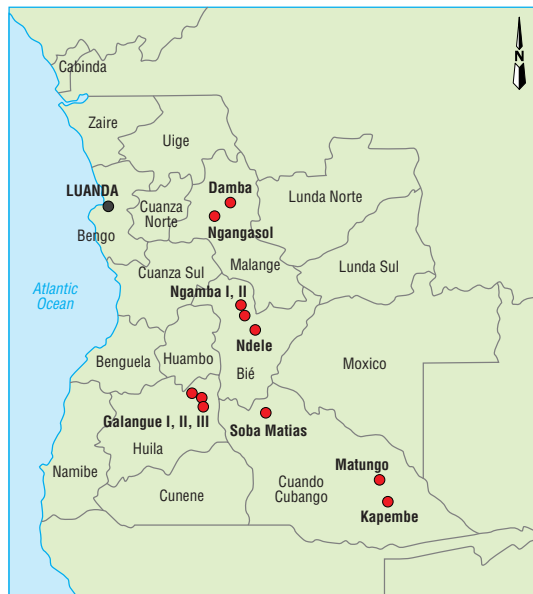
Fig 1 Name and location of 11 resettlement camps for former UNITA members and their families included in the survey. (Base map provided by ReliefWeb-UN OCHA on 30 January 2003; modifications by Epicentre on 31 January 2003)