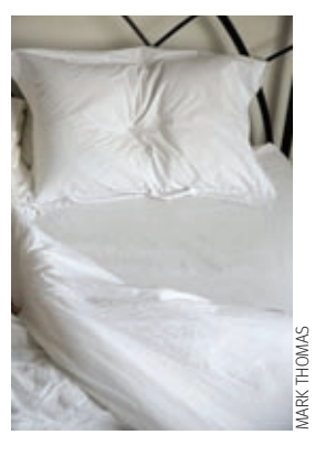
RESEARCH, p 810

Imprecise taxonomy makes interpreting trends difficult