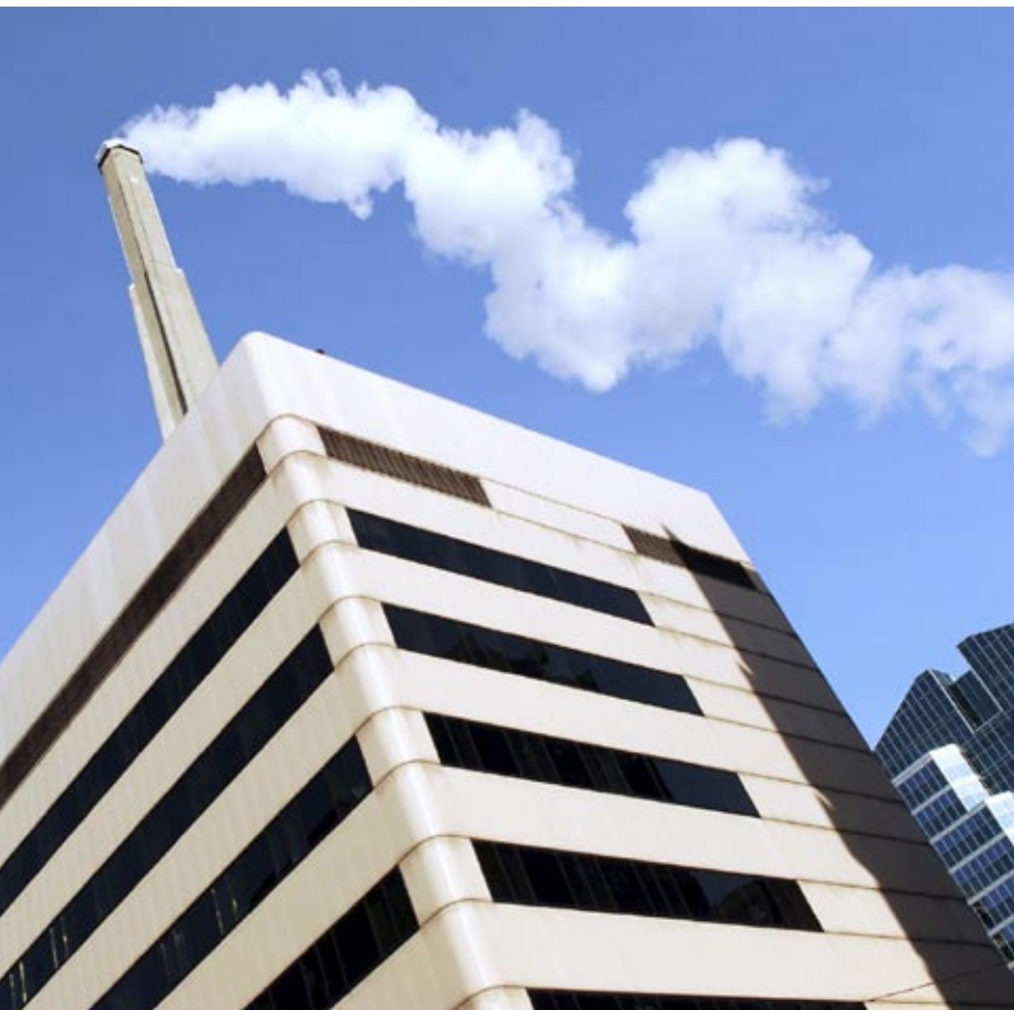
Health care organisations must take urgent action to reduce their carbon footprint

The report sets out what is being done globally, by the European Union and by the UK government to tackle climate change. It provides recommendations for health professionals. Measure your own carbon footprint; turn appliances off; improve ventilation and insulation; save water; reduce waste; buy fresh local produce; and cut down on meat, dairy products, and saturated fats. Avoid overly processed or packaged foods and bottled water. Use public transport, walk and cycle more, cut unnecessary flying and driving.