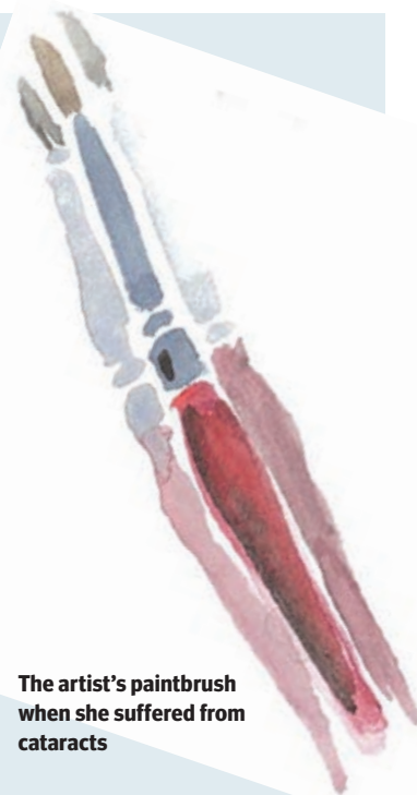
The artist's paintbrush when she suffered from cataracts