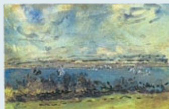
Before the operation