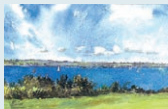
After the operation