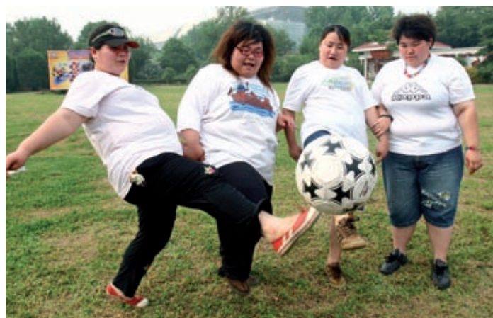
More than a quarter of Chinese women are now overweight

The authors say that applying the results to the Chinese population as a whole indicates that the prevalence of overweight and obesity in the general Chinese adult population is higher than previously reported. In 1991, the prevalence of overweight and obesity were 9.9% and 0.8% in men and 12.9% and